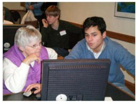
Students from Roxbury Latin High School in Boston help seniors get connected