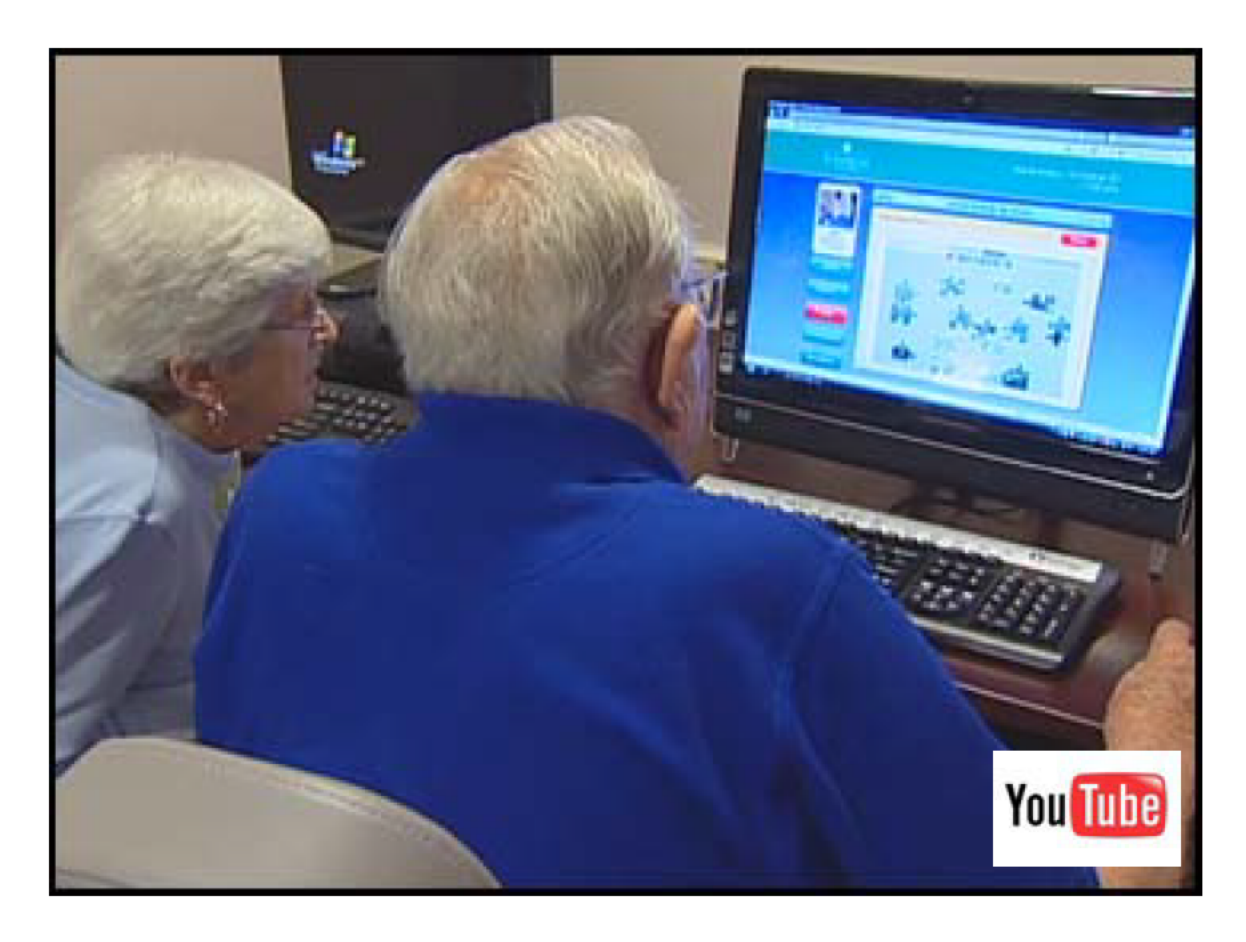
Click here to hear about Connected Living and the BTOP grant opportunity