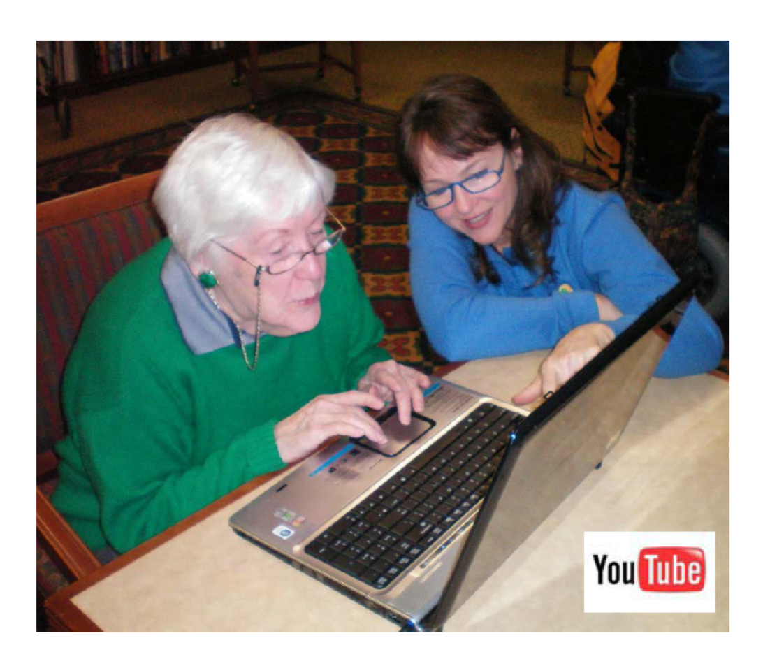
Click here to view video about Connected Living