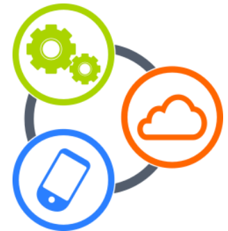
Tools & Resources