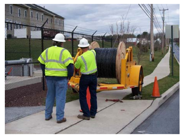
A KINBER crew works with a fiber spool as it prepares to string fiber from poles.

nearly 1,700-mile fiber network to expand broadband in 39 counties across south and central Pennsylvania. In addition, PennREN will improve connection speeds for 60 critical CAIs, including public and private universities, K-12 schools, public libraries, public broadcasting facilities, and medical facilities. The network will enhance healthcare delivery, research, education, workforce development, and public safety and facilitate affordable broadband access, through wholesale offerings, for more than two million households, more than 200,000 businesses, and nearly 1,700 additional CAIs.