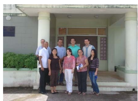
The IT&E team outside the Rota Youth Community Center, one of the newly connected CAIs.

capacity broadband services by upgrading its existing network serving remote and underserved areas and replacing the existing inter-island transmission system utilizing a combination of fiber, 3G wireless, and WiMax technologies. When complete, the project expects to enhance services for 403 CAIs, including community colleges, K-12 schools, libraries, healthcare facilities, and public-safety organizations. The network will allow CAIs in these remote island locations to benefit from video conferencing and other advanced broadband capabilities.