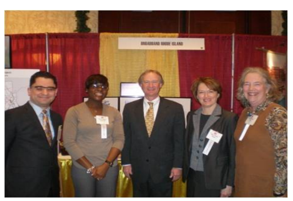
Rhode Island Governor Lincoln D. Chafee joined representatives from OSHEAN, Ocean State Libraries, and Broadband Rhode Island at the League of Cities and Towns Day on January 27, 2011.

libraries. This statewide initiative, known as the Beacon 2.0 Library Computers Center project, provides affordable computer training and access to underserved and geographically dispersed communities with high rates of unemployment. This quarter, OSHEAN completed its goal of deploying 727 computers to 72 libraries. These new computers serve an average of 18,703 visitors per week.