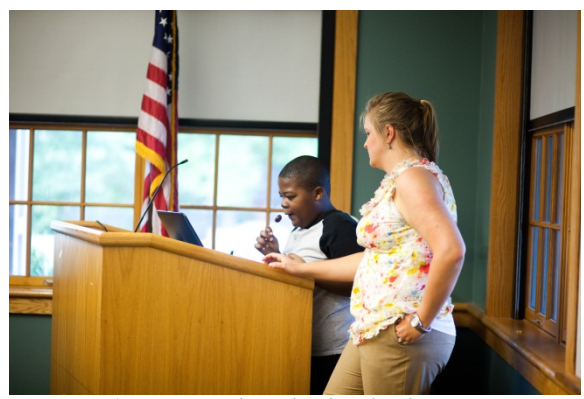
An instructor teaches a local student how to use the Internet during a computer basics course.

As of September 30, 2011, BTOP funds have allowed Connect Arkansas to distribute approximately 130 personal computers and record 408 new sustainable broadband subscribers.