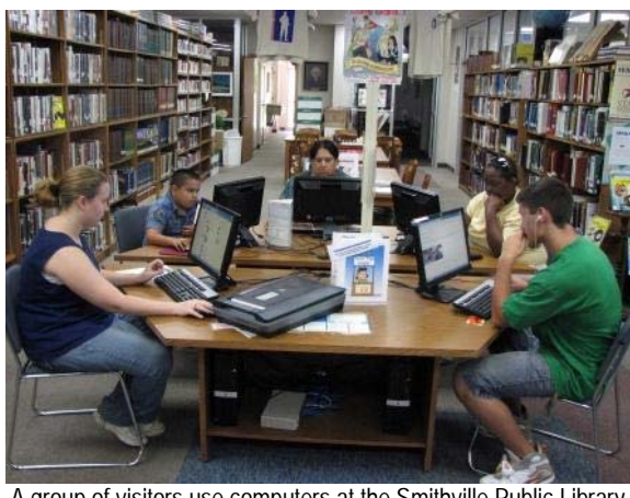
A group of visitors use computers at the Smithville Public Library for email, employment searches, social networking, games, and school-related activities.

created 10 professional development webinars for library staff members, providing them tools and techniques to manage and promote computer resources. For example, TEAL offers a webinar series on how to promote and teach computer technology to seniors and people with disabilities. In addition, TEAL partnered with the Texas Workforce Commission to create a series of workforce skills webinars to teach librarians how to help library patrons with their job searches and career development. By July 2011, TEAL also established more than four full- and part-time jobs to conduct webinars and manage the PCC resources.