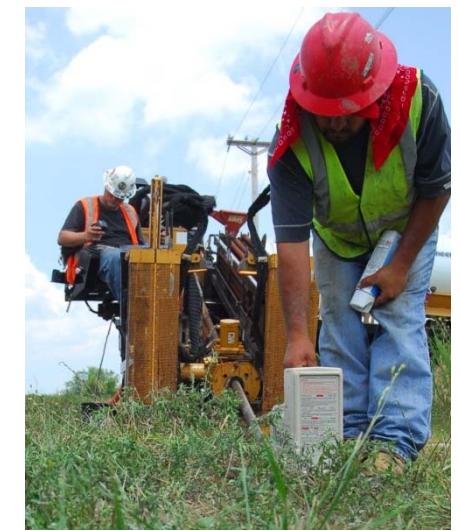
Sho-Me MO contractors use special instruments to carefully locate, measure, and mark directional boring action to place underground fiber conduits.

of its Sho-Me MO middle-mile project, upgrading a total of 457 miles of existing fiber this quarter. When complete, the project will deploy a total of 500 miles of new fiber to complete a 1,380-mile network across 30 counties in south and central Missouri. Sixty workers are constructing the network to bring high-speed broadband access to 100 CAIs, including K-12 schools, community colleges, public libraries, health institutions, and various local governments. One planned use of the network is to promote agricultural efficiencies by using smart energy meters to monitor crops.